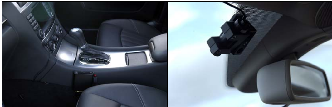
A Drivedata Compact Flashcard Video recorder and miniature camera installed in one of the cars

The onboard systems were carefully configured and installed so as not to detract from the elegance of the Mercedes interiors. In fact, it is very difficult to spot that a camera system is installed at all. Drivedata FB-2 flashcard video recorders and miniature high resolution cameras keep visible hardware to a minimum.